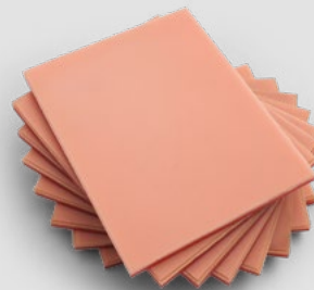
Suture Pad Replacement 10x light | 1024496