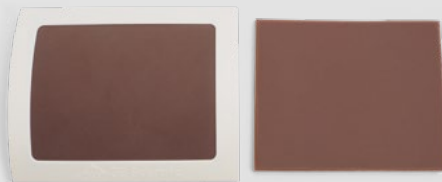
Skin Suture Set Dark | 1024495