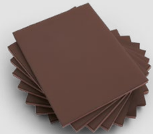
Suture Pad Replacement 10x dark | 1024497